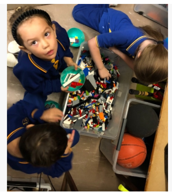
Term 2 favourite photo choice 2021