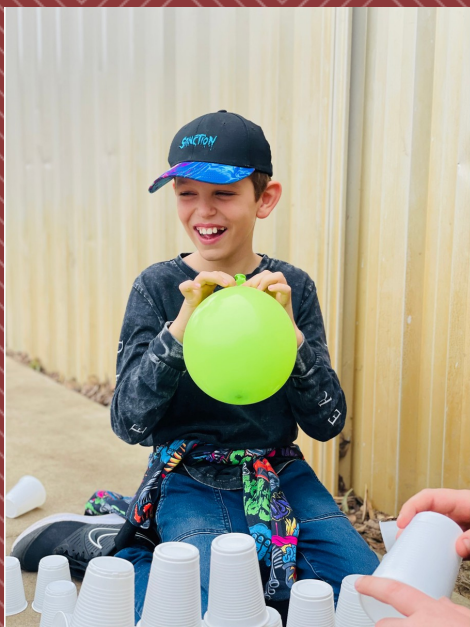
ISSUE 5. FAVOURITE PHOTO CHOICE 2021